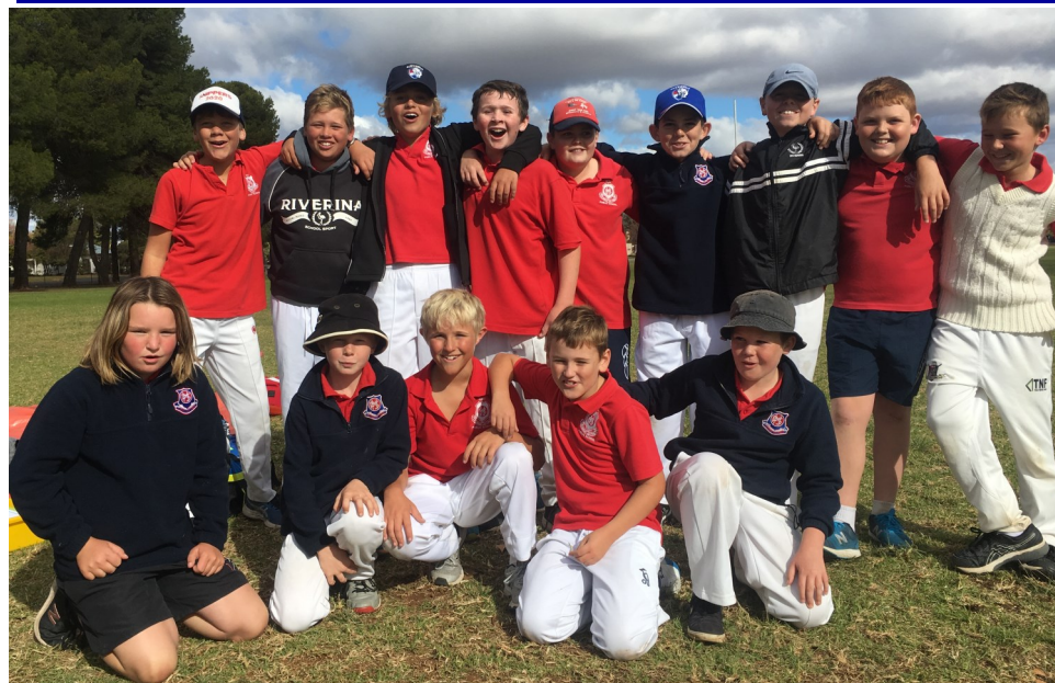
Winning Cricket Team