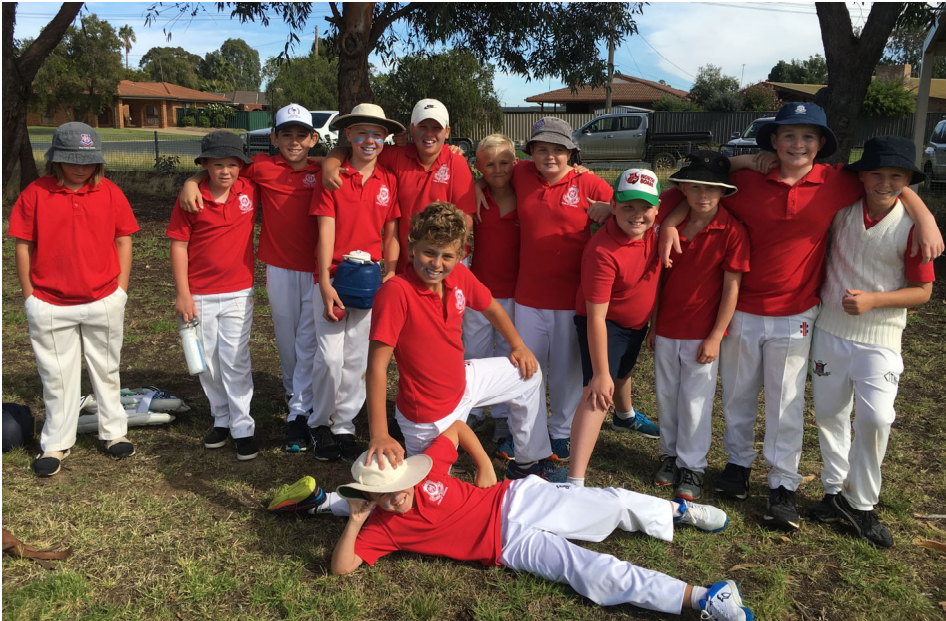
HPS Winning Cricket Team