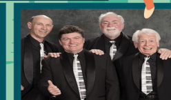
BOARDWALK LIVE IN DENILQUIN SAT 5th DECEMBER Non-member tickets $55, subject to seating availability

Telephone the Con for further details and to reserve your seat 5881 4736