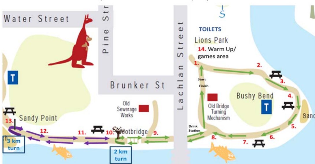
Hay Public School Cross Country Map

It is preferred that all accounts are to be kept in credit.