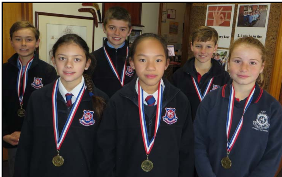
Athletics Age Champions