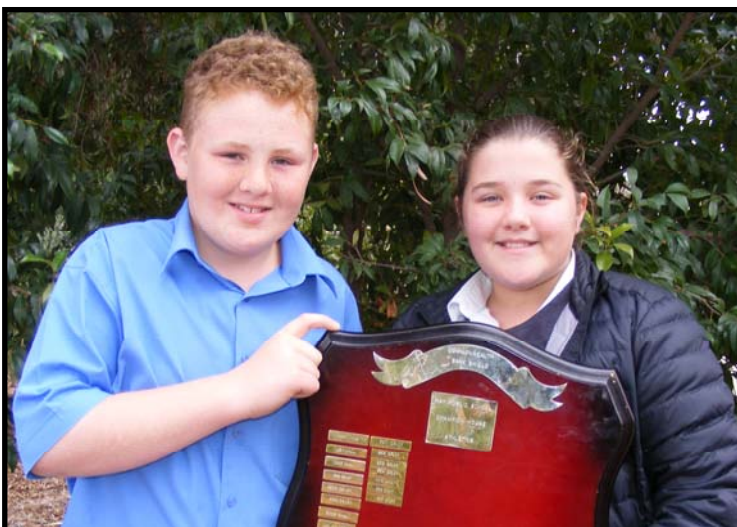
Oxley House Captains