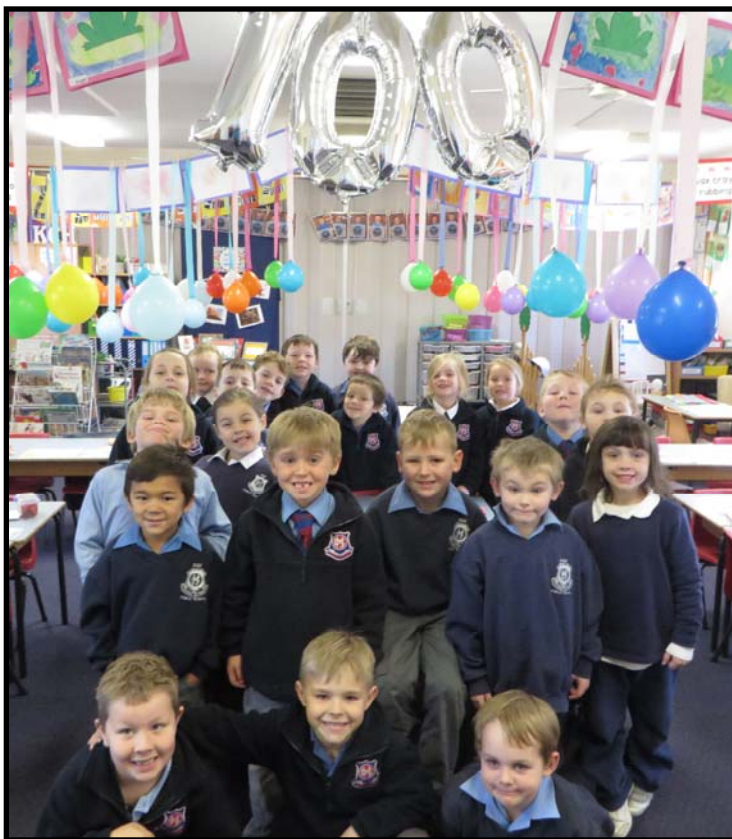
Kindergarten celebrates 100 days of Learning