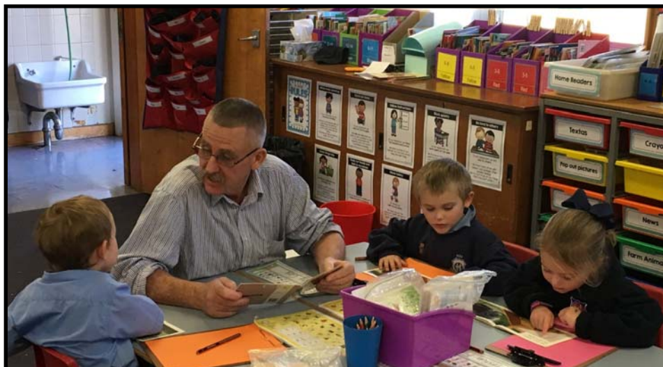
KCH Grandparent Helper