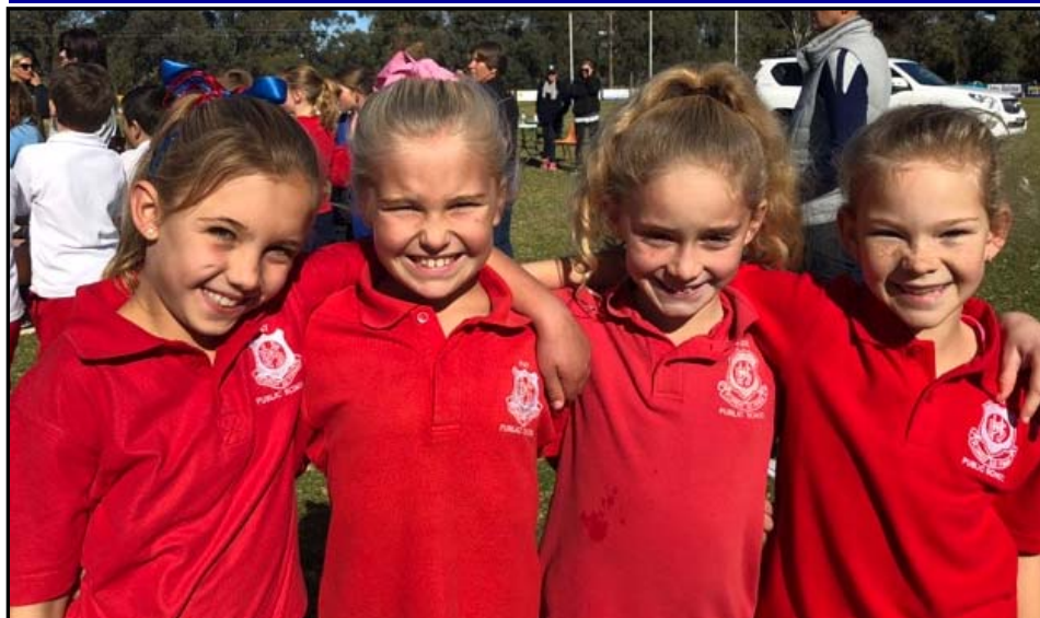
District Cross Country