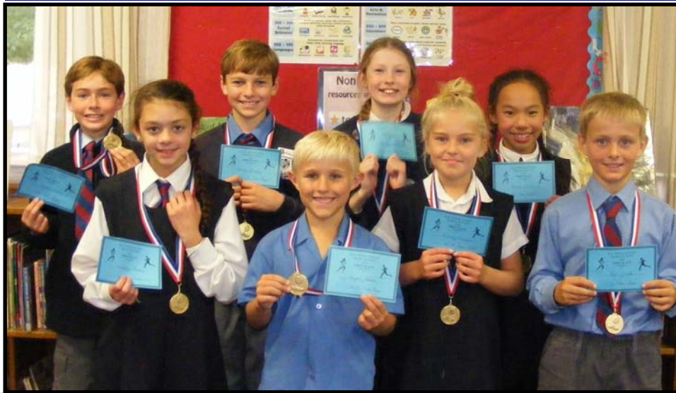
Cross Country Champions