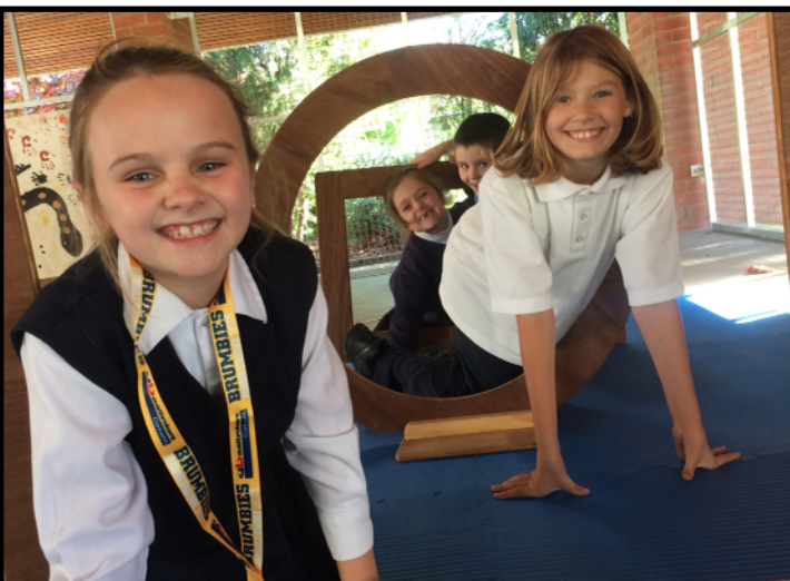
Perpetual Motor Program