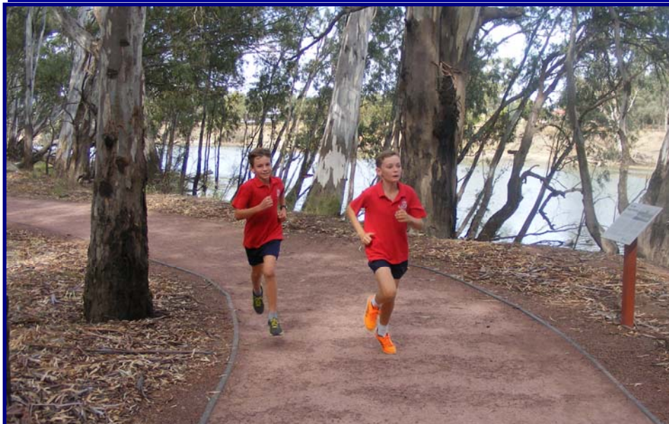
Cross Country 2018