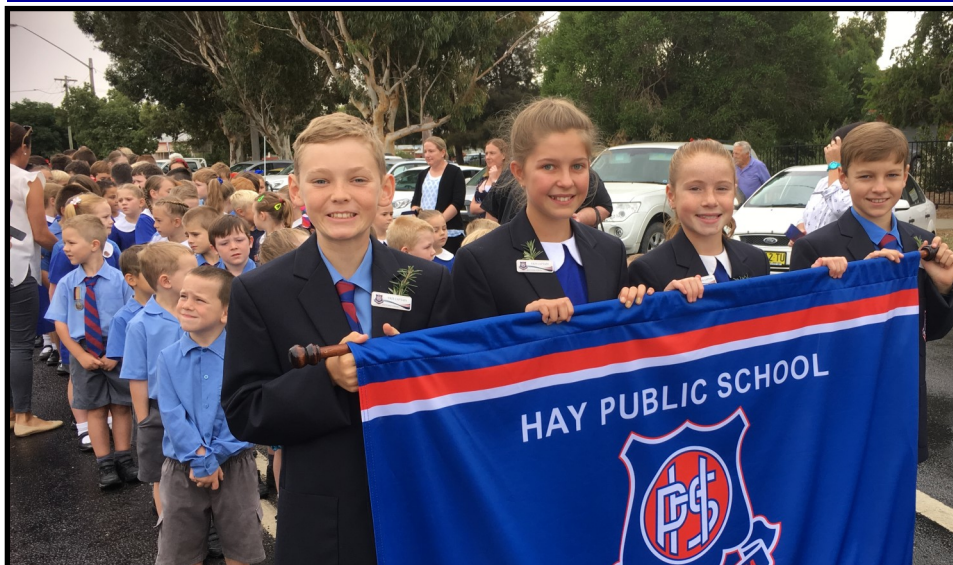
ANZAC March 2018