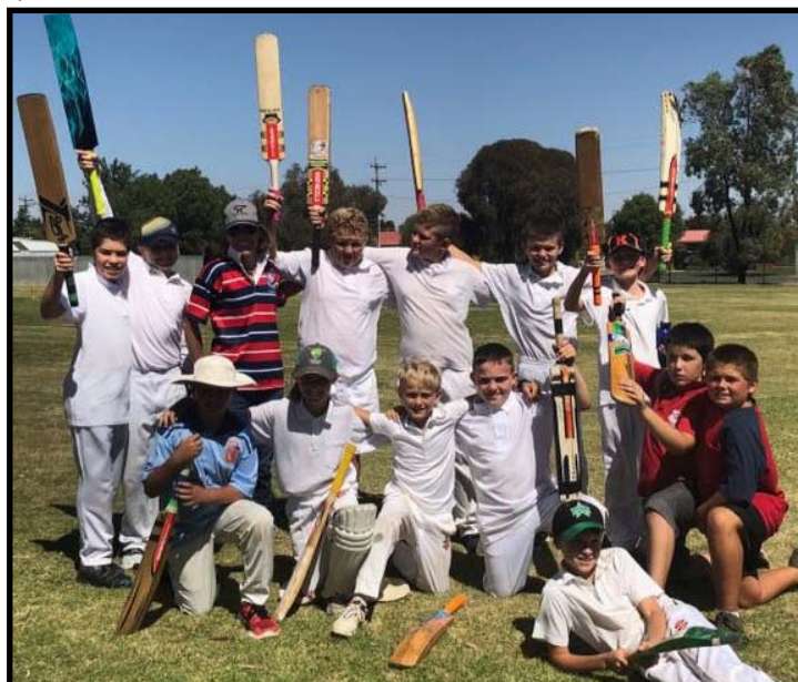
HPS Cricket Team

In a great team effort, we were able to defeat Edward by just two runs and meet Griffith in the next round.