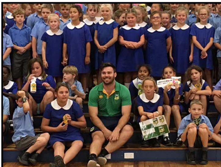
NRL Wellbeing Day