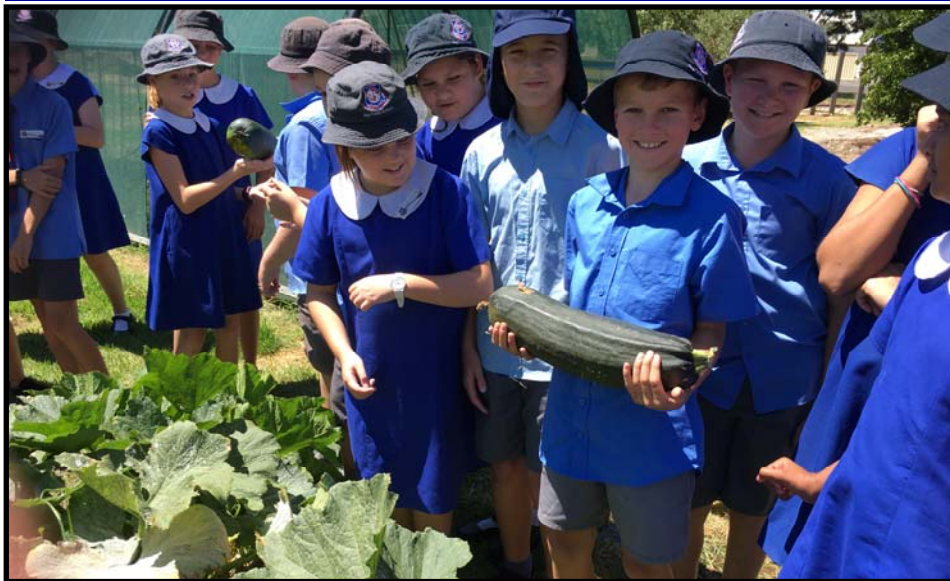
Kitchen Garden ~ Bumper Crops