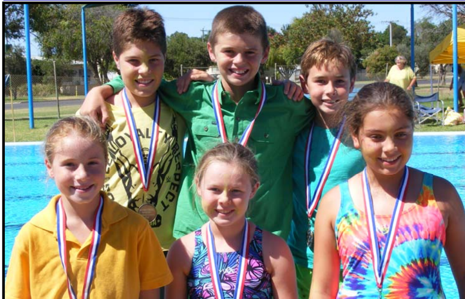
2018 Individual Swimming Champions