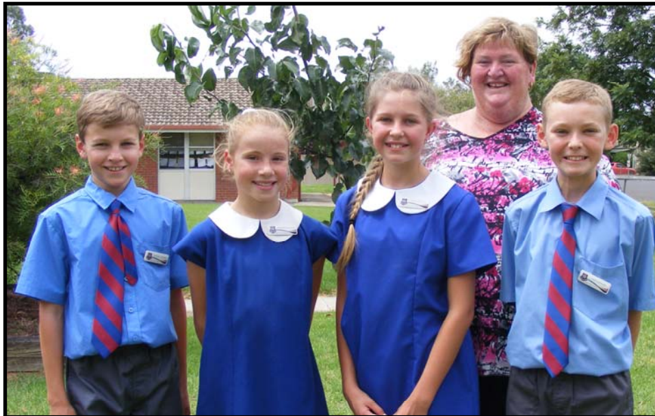
School Captains 2018