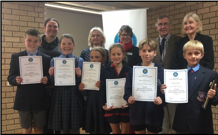
CWA Public Speaking