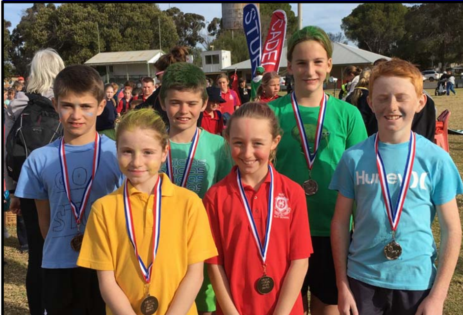
Athletics Individual Champions