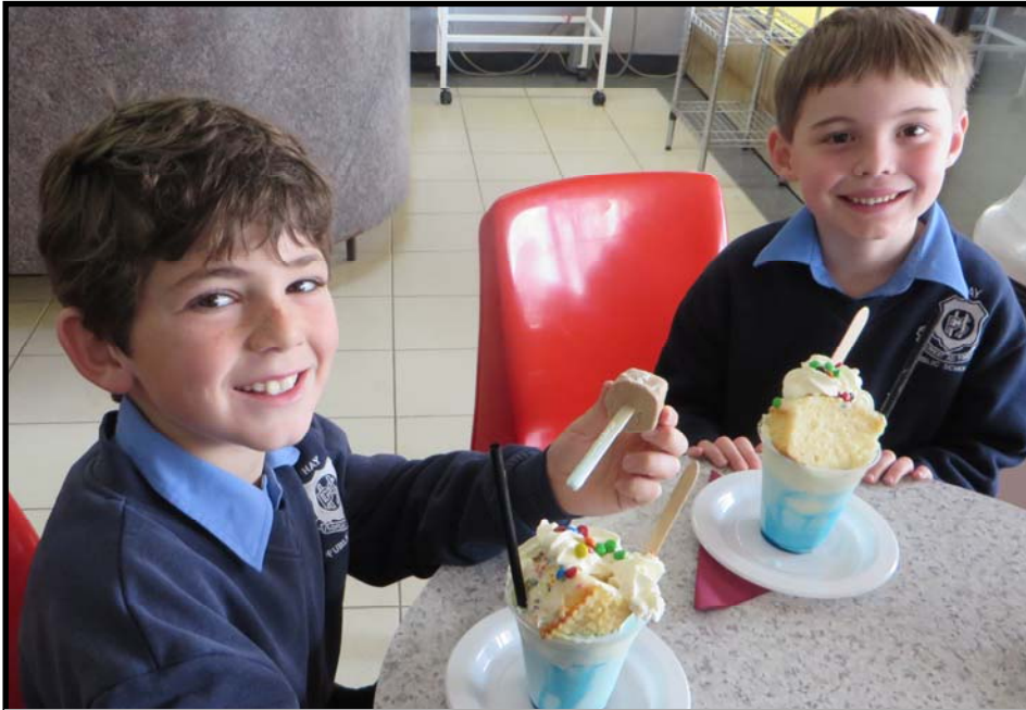
Principal's Reward for Term 2