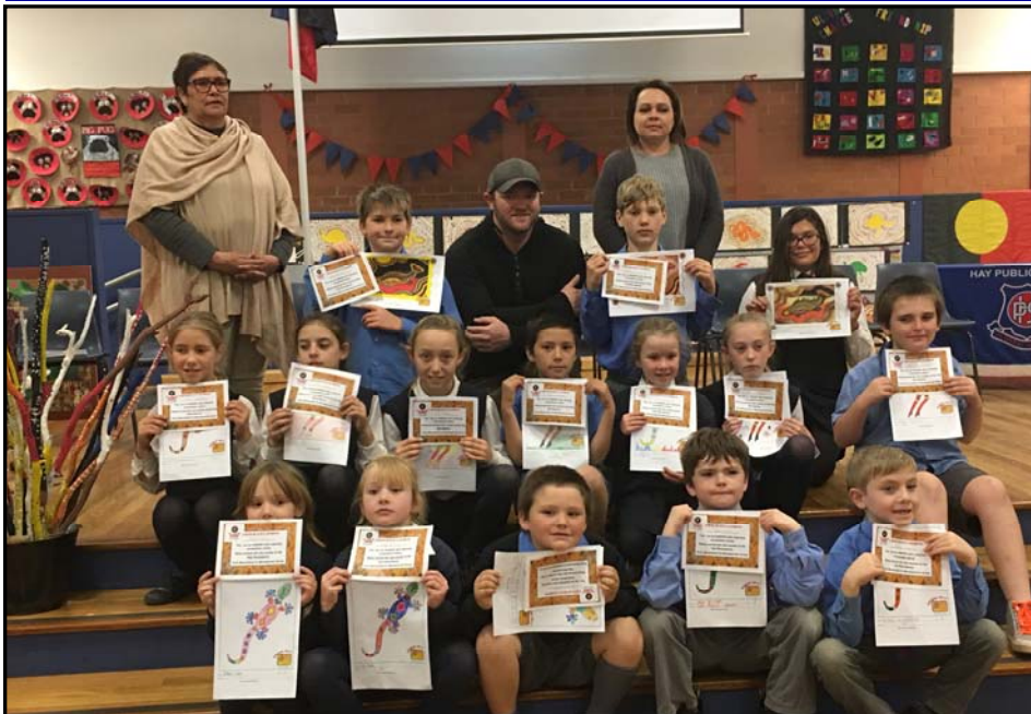
NAIDOC DAY COLOURING COMPETITION 2017