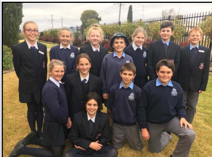
HPS Debating Team