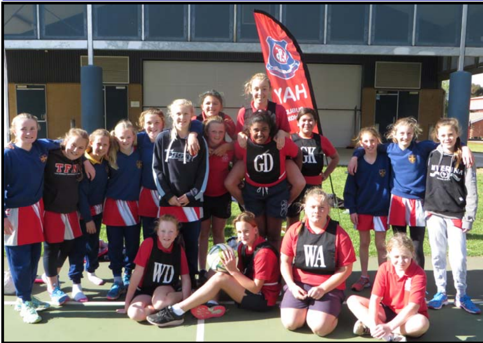
Interschool PSSA Netball Knockout