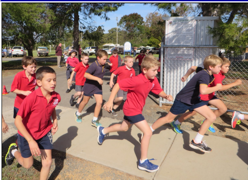
Cross Country 2017