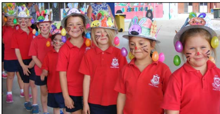
Easter Hat Parade