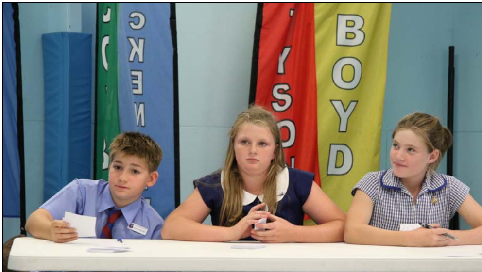
HPS Debating Team