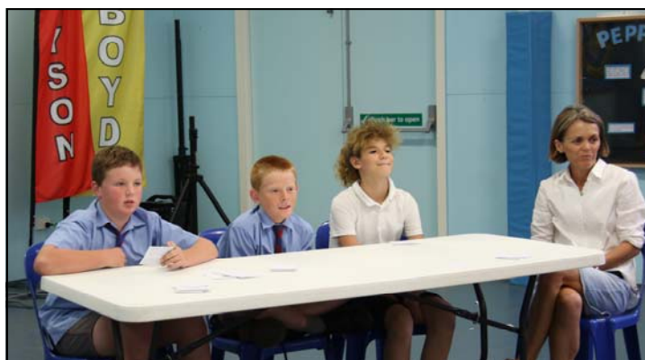
HPS Debating team at Deni North

TICKETS & DONATIONS TO THE FRONT OFFICE PLEASE