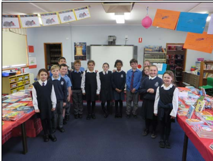
Students from 3/4R enjoying Book Week