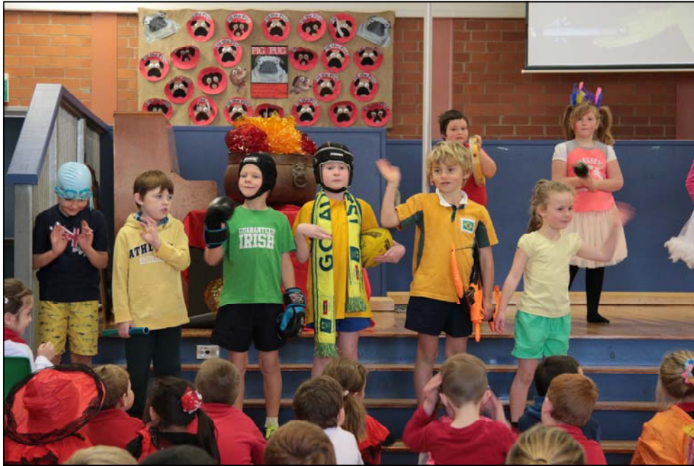
1/2B - Go To Rio