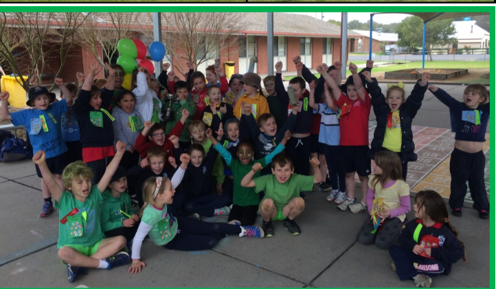
Jellybean Cup winners, OXLEY