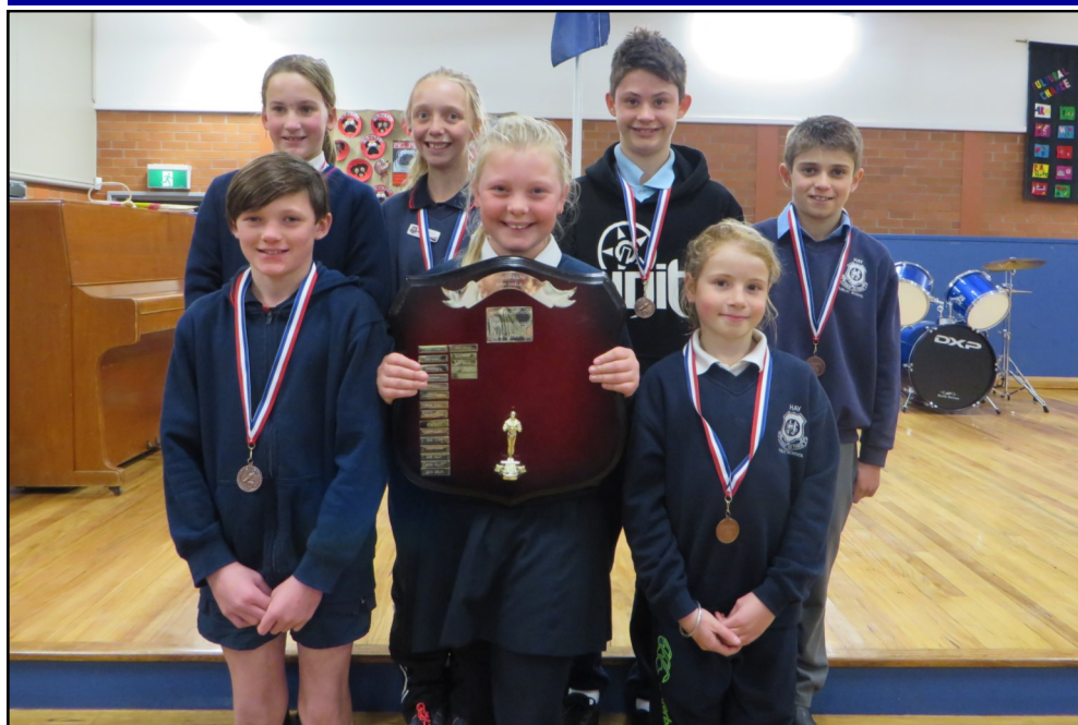
Athletics Carnival Champions