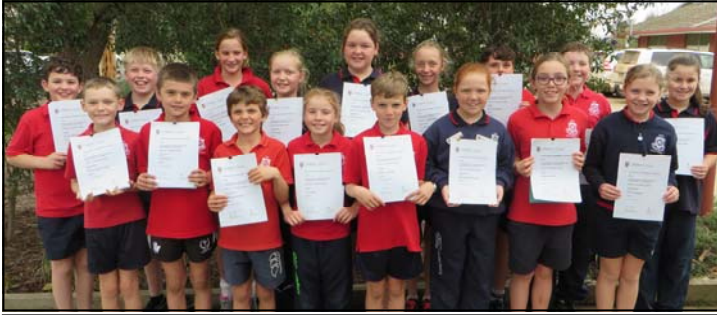
UNSW Digital Technologies participants