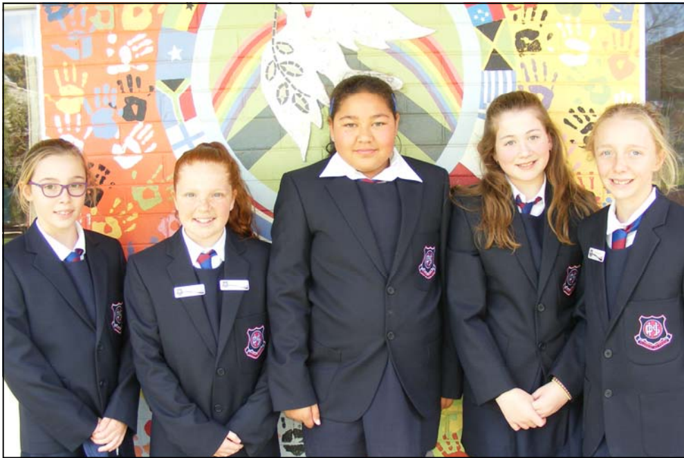
Hay Public Lachlans—Debating Team