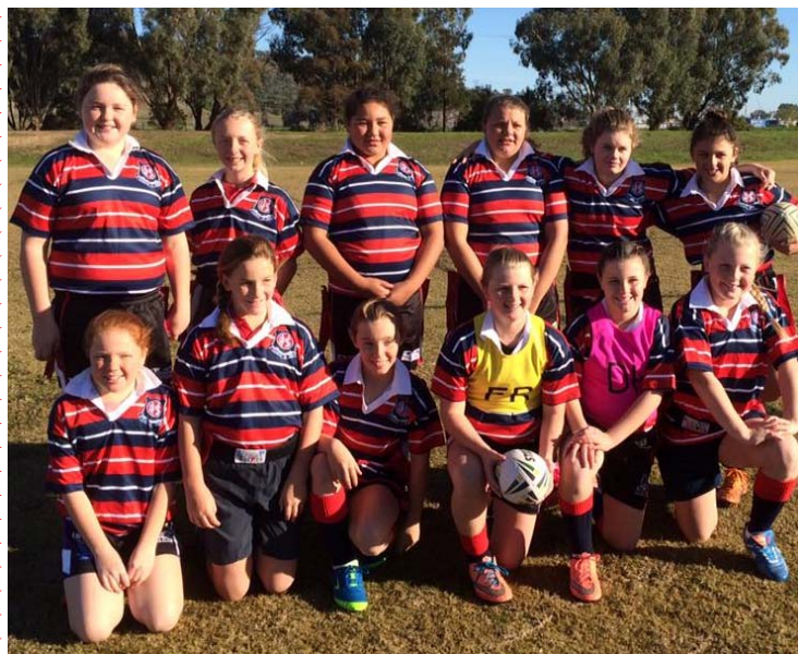
HPS Girl's Leaguetaag Team