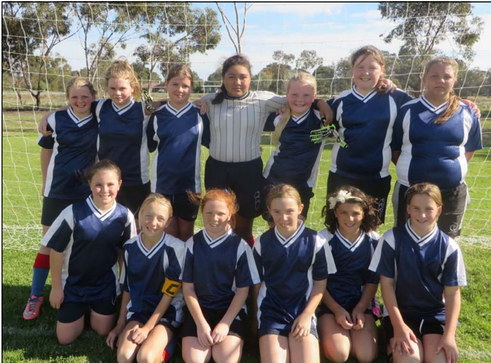
HPS Girls' Soccer