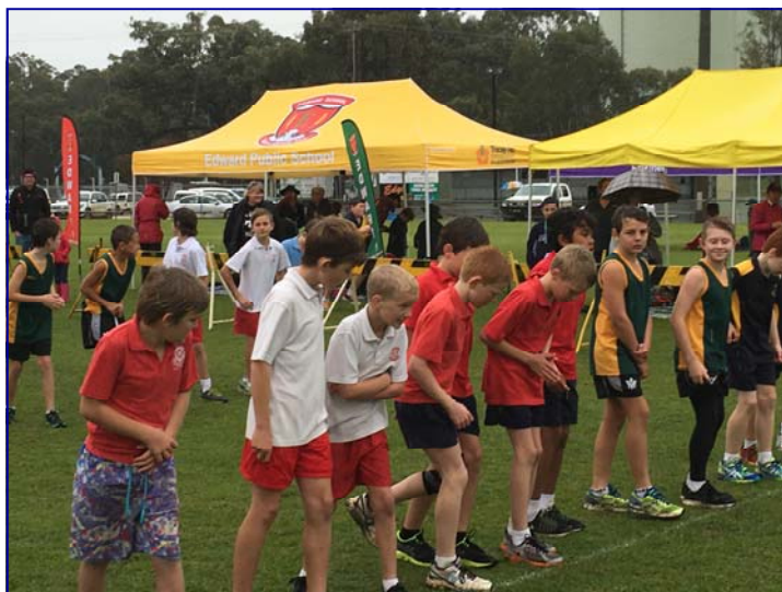
Cold and wet, they still ran!

Stage 3 Sport will focus on Soccer and Leaguetag.