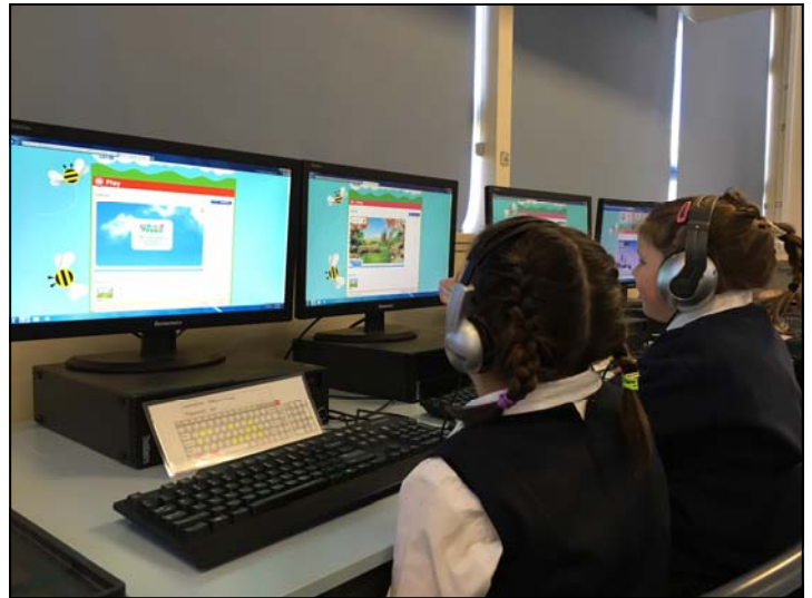
Kindergarten Computers with Marlee & Bella Students attend a computer lesson with a dedicated computer teacher each week.