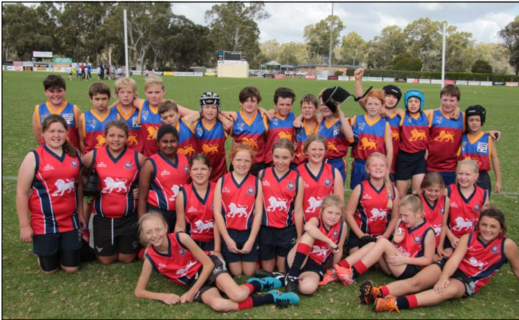
Paul Kelly Cup