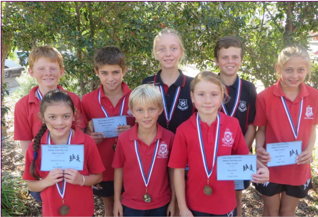
Cross Country Champions