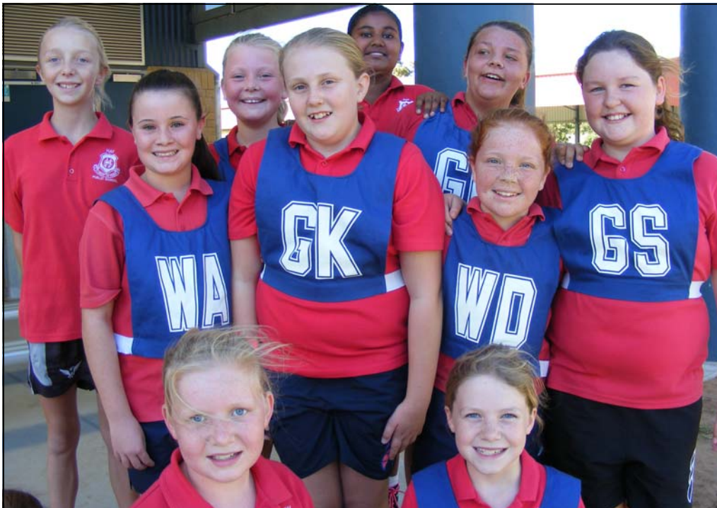
Hay Public School Netball Team