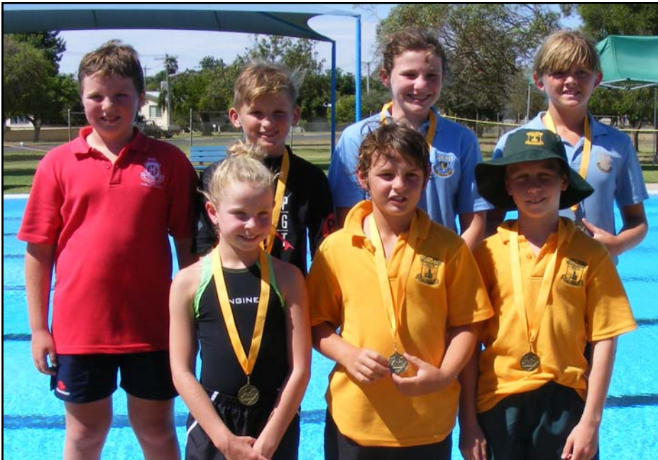
District Swimming Champions