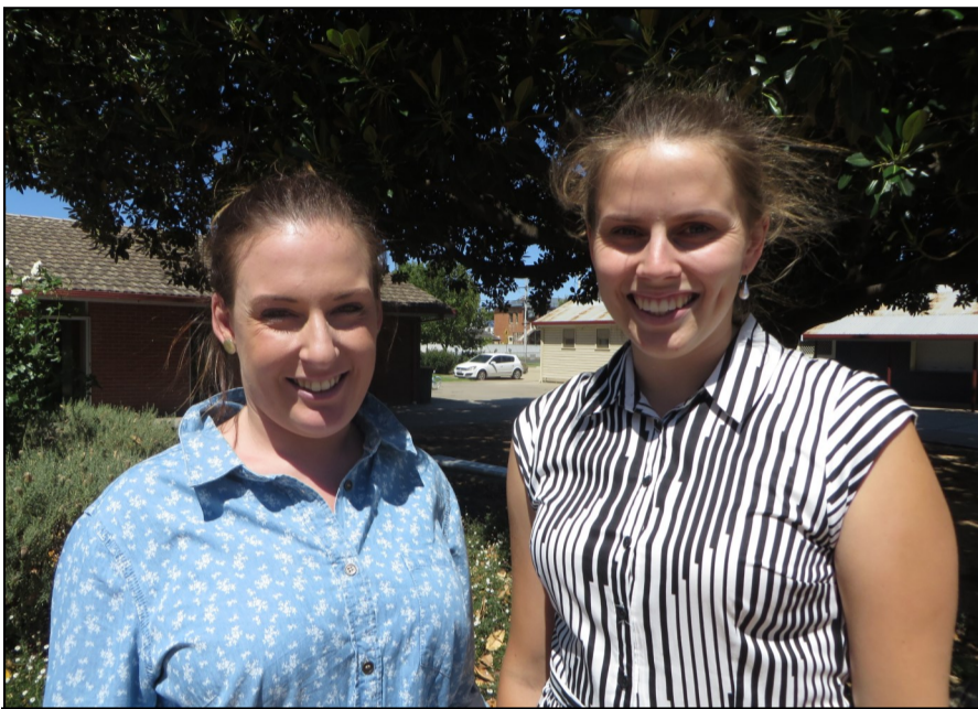
'Welcome to our new teachers'