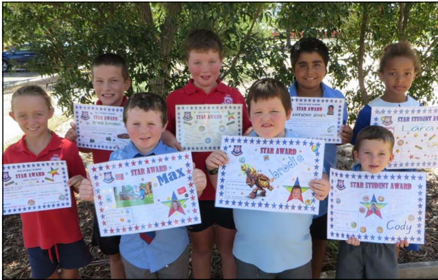
Our Shining Stars