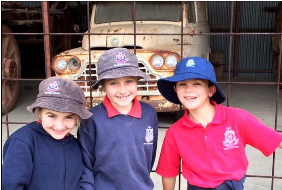
Hay Gaol Visit