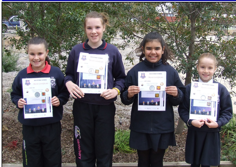
Premier's Spelling Bee Champions