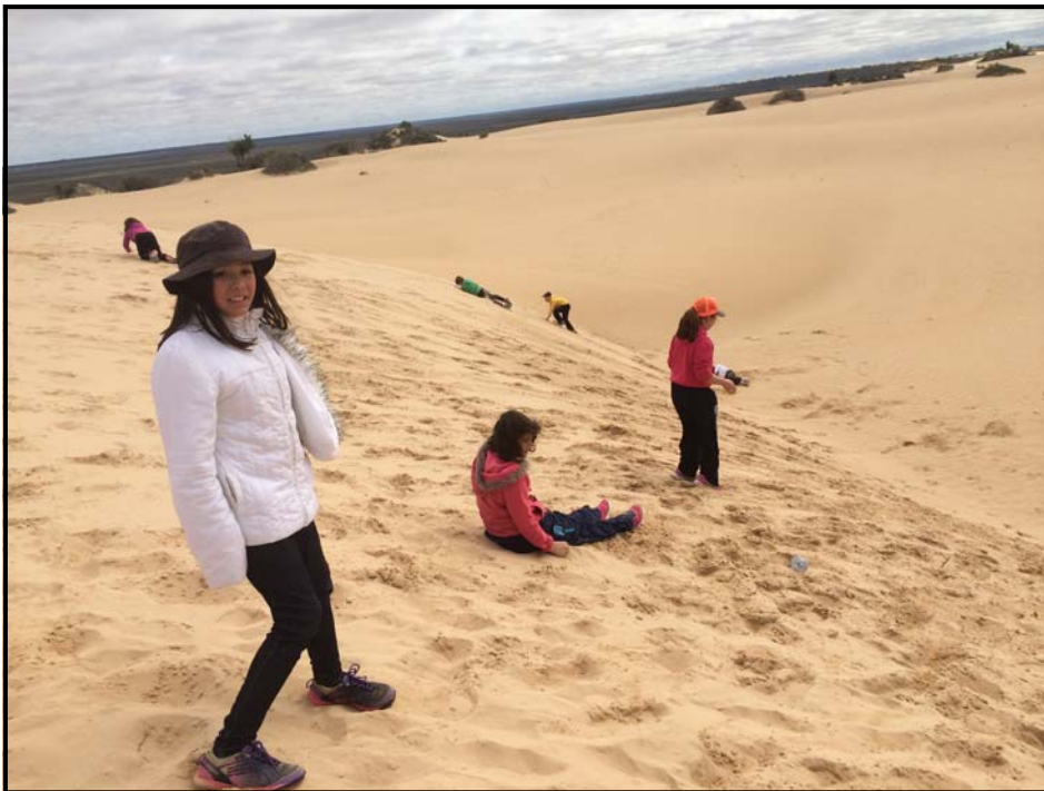
Stage 2 Excursion - Lake Mungo & Swan Hill