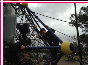
Stage 1 Excursion to Griffith