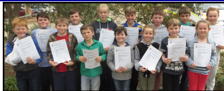
UNSW Science Competition Awards