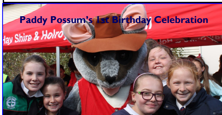
Paddy Possum's 1st Birthday Celebration