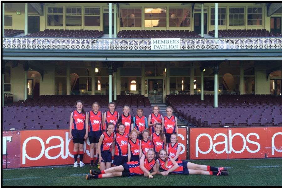
Our AFL Champions!