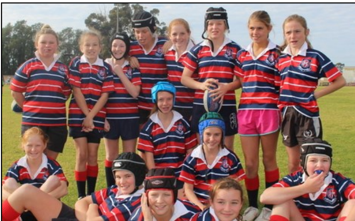
Paul Kelly Cup - AFL