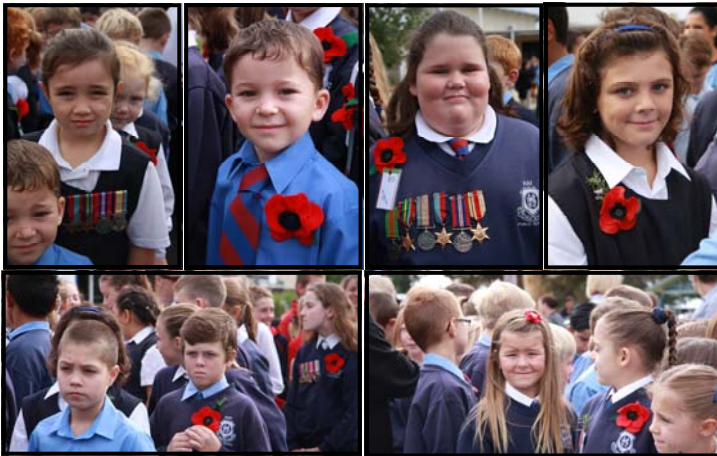
Students participating in ANZAC March