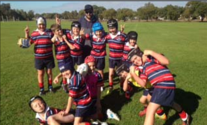
Trent Barrett Shield

Our annual Cross Country/Fun Run will be held around the Hay Park block and No 1 Oval this Friday 1 st May. The run will commence at approximately 1:30pm, with the 8/9 year boys, followed by the 8/9 year girls. Children will assemble in the shelter at 1:00pm and walk to the park with their classroom teacher. Games will be organised between races. 8, 9 and 10 year olds complete one lap of the park block (approx. 2kms). 11, 12, 13 year olds complete one lap of the park block and two laps of the oval (3 kms). Sensible footwear should be worn and a water bottle carried (if desired). Parental help is needed to supervise the course. If you are able to assist, could you please contact Mrs Pearson. The first four place-getters in each age division qualify for the District Cross Country to be held on Thursday 28 th May, in Deniliquin.