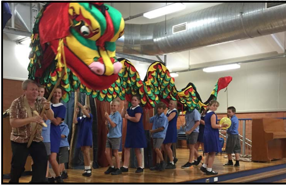
G'Day Asia Performance.