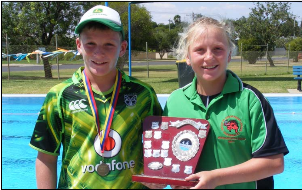
Oxley House Captains. Well done!