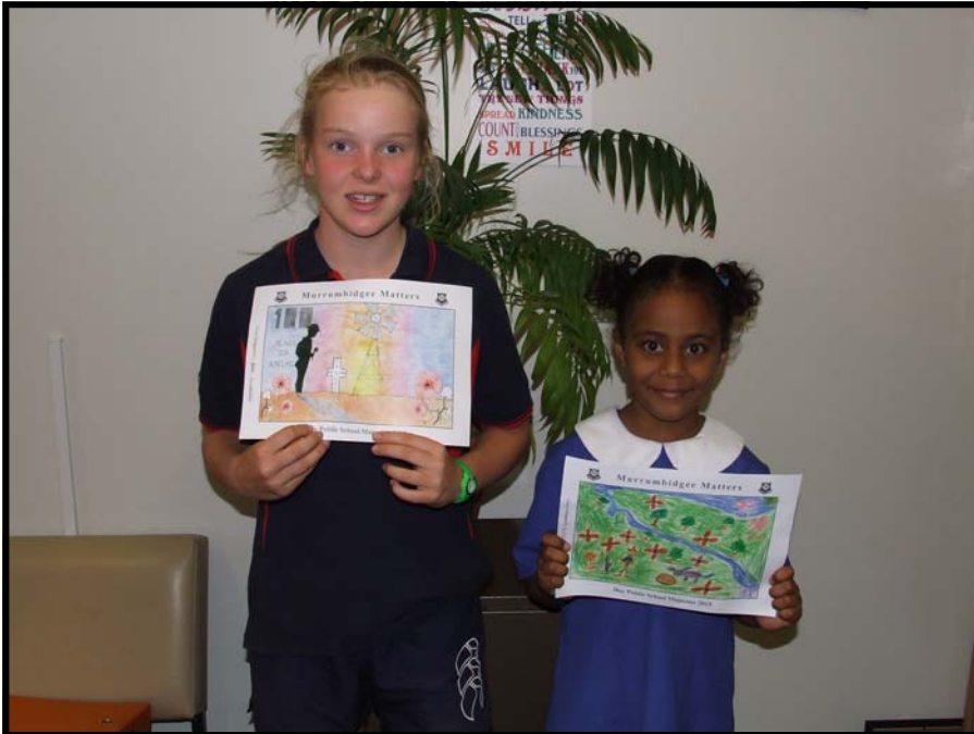
Murrumbidgee Matters Winners.