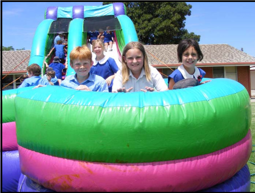
No Greenslip Reward Slide