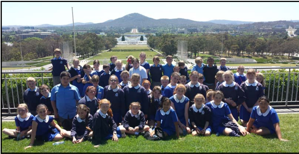
Stage 3 Excursion to Canberra