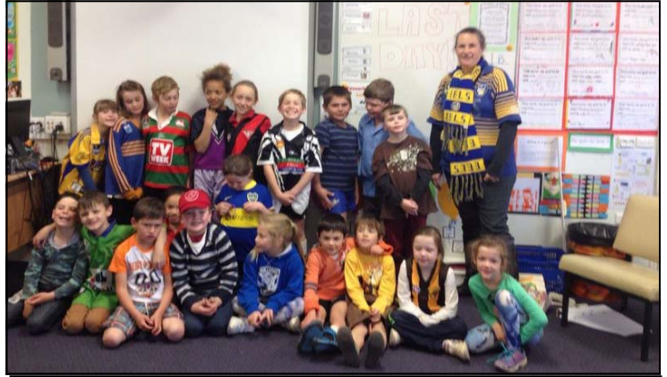
1/2B enjoyed Favourite Footy Colours Day!