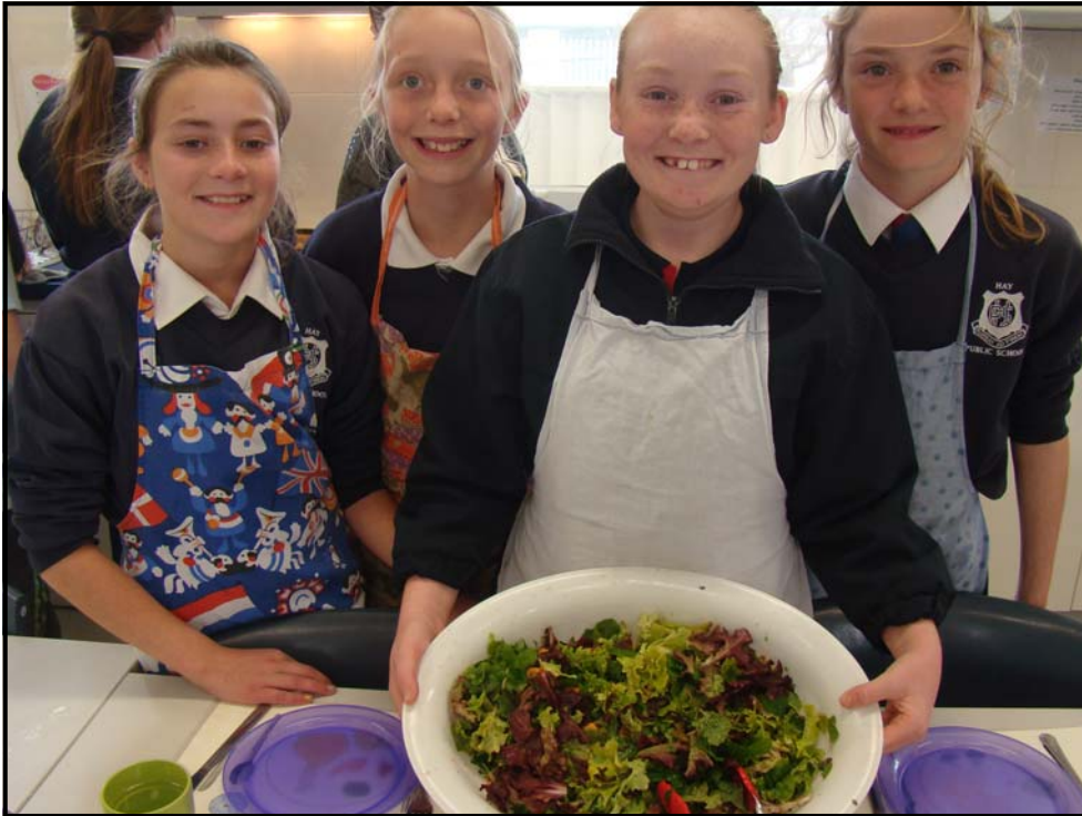
Engaging Learning Activities for Students