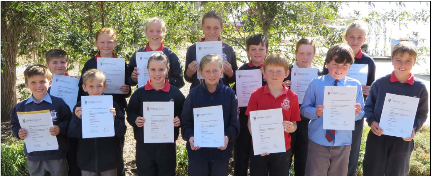
UNSW Spelling Competition participants