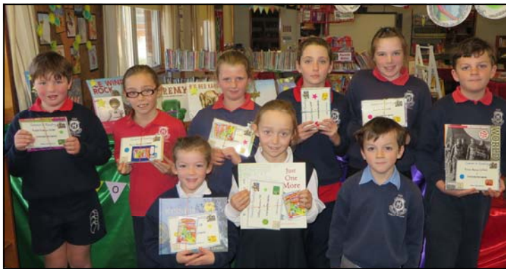
Winners of the 'Extreme Reading' photography competition.

Thank you to all families and community members who supported our Book Fair last week. There were many great books for sale and the students had a wonderful time selecting from the great range. Our school library now has many new titles to add to our fantastic collection.