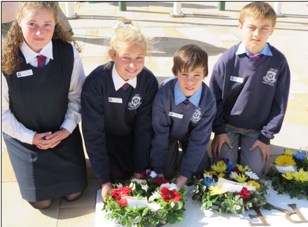
Captains Laying a Wreath—VP Day

Next K-6 Assembly Friday 22nd August 9.30am School Hall All welcome